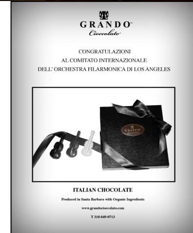
Created for the L.A. Philharmonic Interational Committee