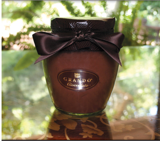
GC 22 kt. Gold Dust™

Alkalized Cocoa Powder 4oz Tureen. 22 kt. Gold Dust $9.50 8oz Tureen 22 kt. Gold Dust $15.50