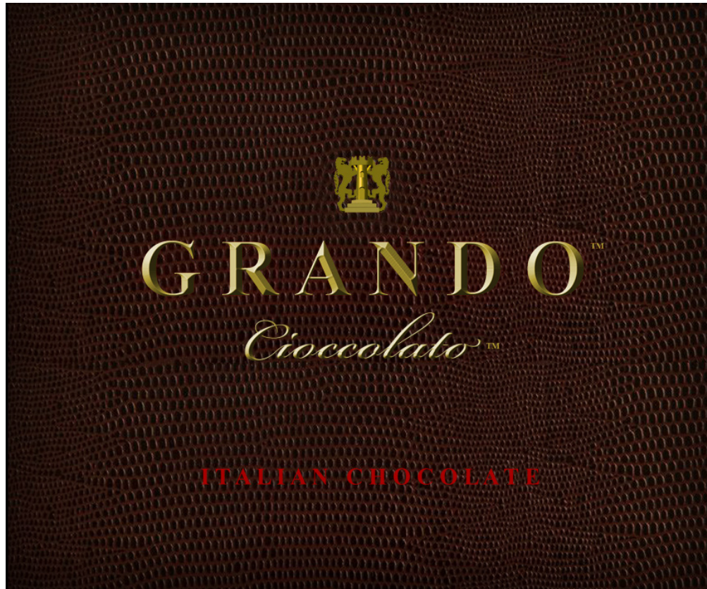
Table Of Cioccolato