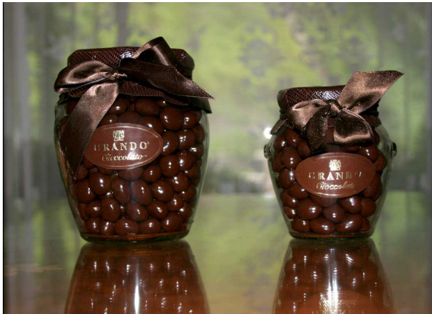
GC Espresso Pearls™

100% Natural Italian Roasted Cocoa Beans 100% Natural & Sugar Free 5 oz Tureen 24KT Cocoa Nuggets $10.00 11 oz Tureen 24KT Cocoa Nuggets $22.00