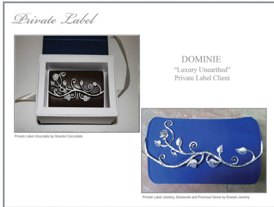
Grando Cioccolato Custom Chocolate Purses Grando Jewelry Custom Purses

Academy Awarded Winning Producer Jon Landau commissioned Grando Cioccolato to produce a 3D custom solid Italian Chocolate replica of his family for their 2013 "Sweet Holiday" Gifts.