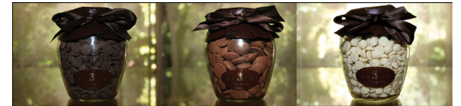
Grando Cioccolato Cabochons

4oz Tureen Gift Set $26.00 8oz Tureen Gift Set $54.00