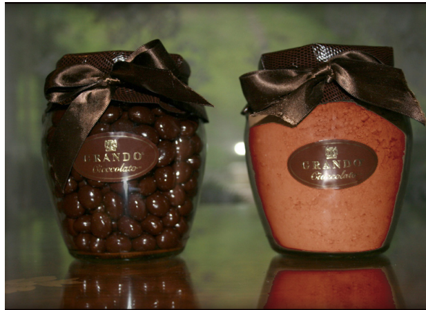
Gift Set of Tureens

Espresso Beans coated in Dark Cioccolato 8oz Tureen Espresso Pearls $18.00 16oz Tureen Espresso Pearls $34.00