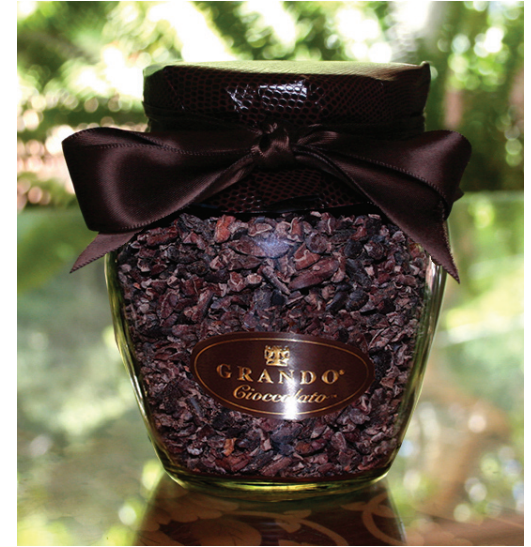
GC 24 kt. Cocoa Nuggets™

Alkalized Cocoa Powder 4oz Tureen. 22 kt. Gold Dust $9.50 8oz Tureen 22 kt. Gold Dust $15.50